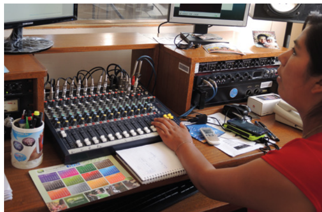
Access Agriculture trains communication professionals across the South to translate video scripts into local languages and record voice overs.

Access Agriculture has a hands-off approach, making videos freely available to anybody to download from its video platform and use in different ways. While Access Agriculture rarely shows videos itself, it has formed formal partnerships with over 70 organisations that use the videos from its platform in their own farmer-training programmes. Access Agriculture does not pay its partners to show videos, but relies on the high quality of the sound, photography and content to motivate