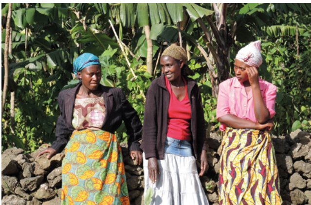
Access Agriculture targets women in particular, as they have been most ignored by agricultural advisory services.

Agricultural training videos aim to share new ideas with audiences so that they will learn from and use this information to improve their livelihoods. Learning does not stop when the video ends, but continues as farmers (or others) discuss it and experiment with the innovations they have seen. The video can be part of a facilitated package, such as a farmer training programme that includes practical field exercises. What people learn from a video can be seen from how they use the information conveyed, for example if they have changed any farming practices. Watching a video may also lead to social changes, such as the formation of new groups. Videos also have the advantage of reaching youth, women or disadvantaged people who are normally excluded from formal extension training.