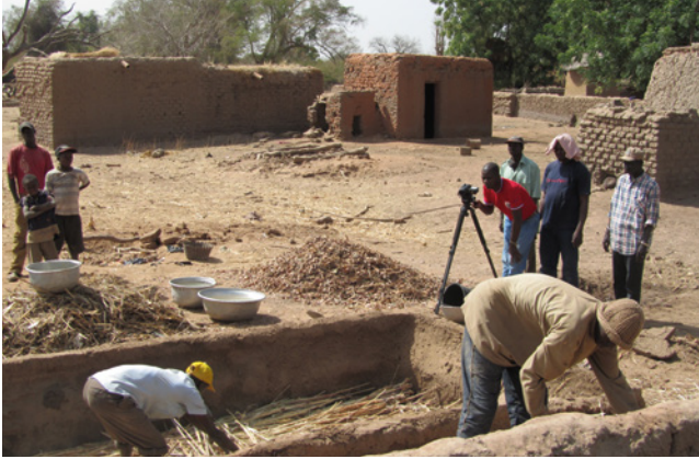
Well-made videos allow farmers to learn from their peers without external facilitation.

Benin one extension worker serves about 500 farmers (MAEP, 2014). Moreover, women make up just 15% of the world's total extension staff, according to GFRAS (2012). On average, women make up almost half (about 43%) of the agricultural labour force in developing countries, and even more (about 67%) form the world's livestock keepers – yet only 5% of these women farmers benefit from extension services ( Ibid ).