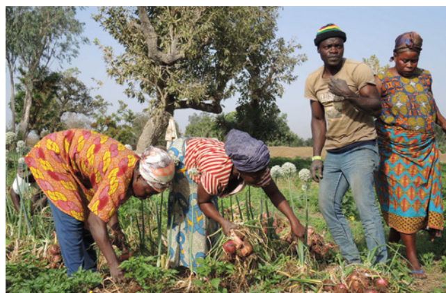
Experienced onion growers in northern Ghana add their own expertise to a series of training videos.

video. The main topic may come from farmers, but not always. For example, if a new pest is about to reach a region, farmers may not even know it is on its way. Research helps to decide what would be a relevant priority issue for farmers. This involves consulting with stakeholders such as agricultural extension, research and development agencies - and it is vital that farmers, the target group, are involved in deciding what the topic should be. For Access Agriculture, finding a topic that can be relevant in many places is also very