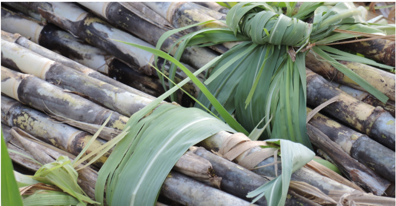
Video production with farmers is a bonding process you can't rush.

Video-makers must build trust with local people when producing videos with them. Good relationships - and clear communication - help to ease the work in the field.