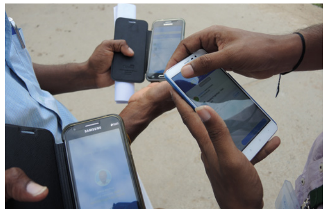
Farmers have become the largest professional group downloading videos from the Access Agriculture platform.

The burning centres copy movies and music videos onto people's flash discs, memory cards or DVDs, for a small fee. The DJs convert videos into 3gp (Third Generation Partnership) format which their customers can watch on their phones. In spite of their small screens, even the cheap (non-smart) mobile phones allow almost anyone to watch videos – including farmer-training videos. In 2014, Udedi offered the DJs Chichewa-language videos from the Access Agriculture platform. Two years later, 96 DJs were distributing training videos from the platform to an increasing number of farmers through their burning centres.