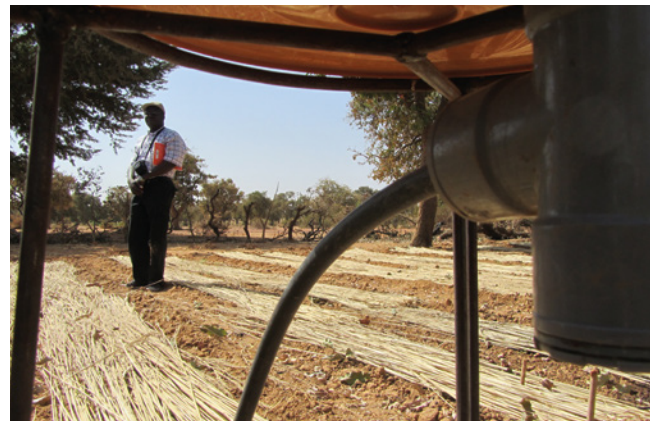
One of the videos on drip irrigation for tomato, produced in Burkina Faso, quickly traveled the world, being translated in over 30 languages from across Africa, Asia and Latin America.