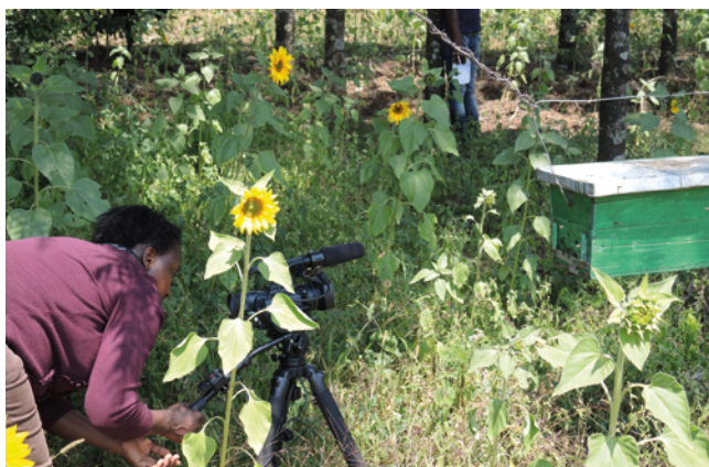
Making a video for farmers is a two-way learning street.

Farmers often like seeing smallholders from other places telling how they solve problems. If video is well planned and properly filmed to show useful information, the audience accepts translated videos from other countries. The farmer audience pays little attention to how the people in the video are dressed, or their skin colour, but quickly notices whether the land is hilly or flat, if the soil is hard or sandy, and the tools used by the foreign farmers. When the natural environment shown on the screen is much different from the one at hand, the farmer