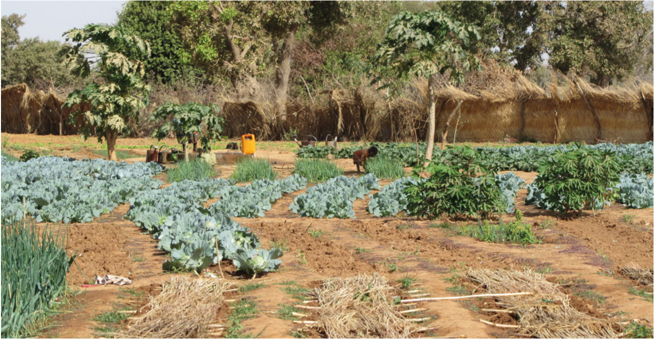
Community gardens in West Africa centered around a well and protected from free-roaming animals.

particularly from Cameroon and Egypt have also contacted Access Agriculture to air videos.