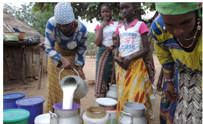
Fulani women in Nigeria have been trained to supply quality milk to an international company.

The storyboard can include details about the content and sequence of the different shots, the materials required, camera focus, and so forth. Digital Green, an organisation working with video since 2006 2 , uses a storyboard to create participatory farmer-training videos. Digital Green and local partners prioritise ideas about what behavioural changes need to be promoted