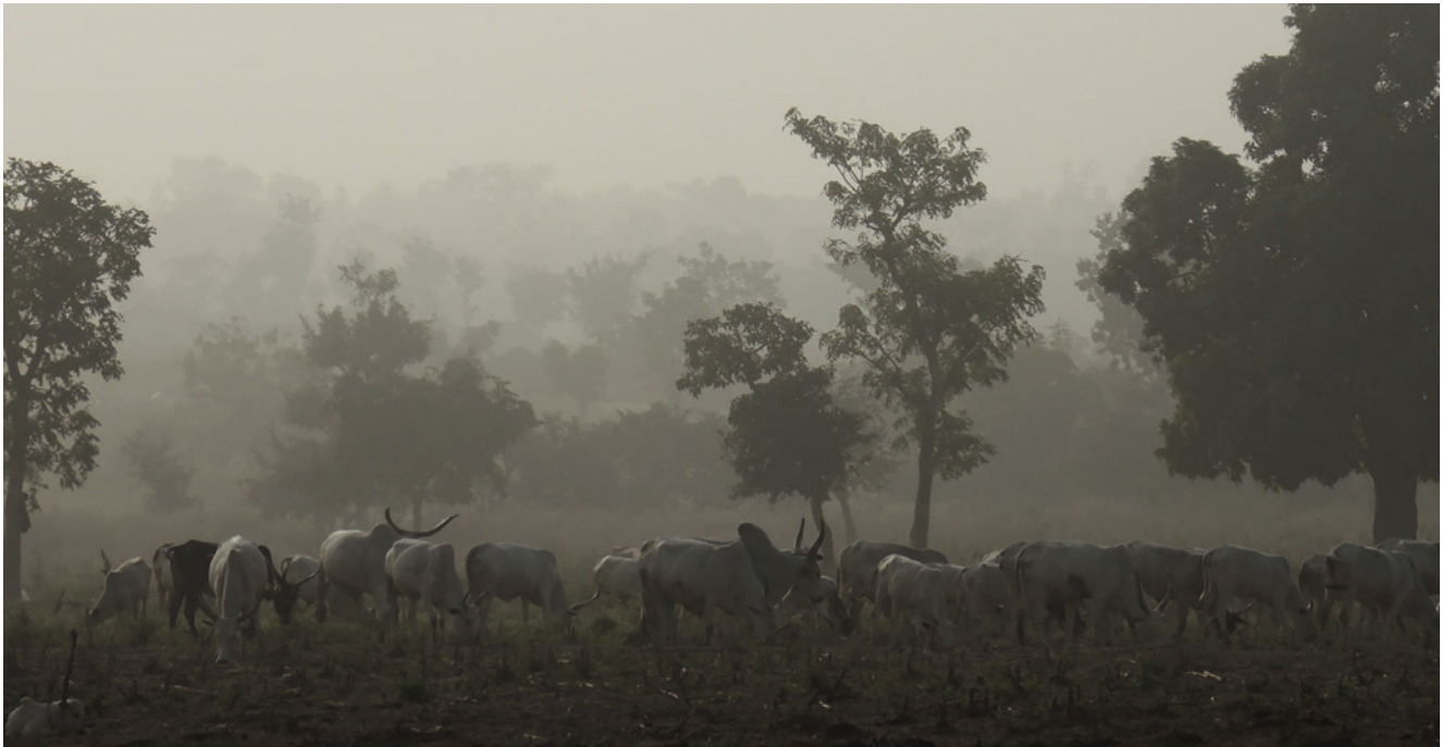
Farmer-to-farmer training videos help the pastoralist Fulani to sell pure, hygienic milk.