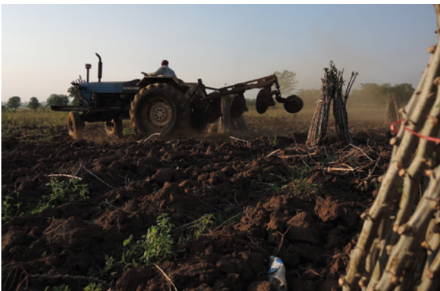
Well-made videos allow farmers to learn from their peers and to adjust the ideas to their own context.

For example, another 2014 blogpost by Paul Van Mele tells about an experience from Benin, where a local NGO trained in video production (DEDRAS) needed to modify their fact sheet on soya production to reflect different realities even within their country. A script was written in the north, where the land is flat and tractor-friendly, but when farmers in central Benin saw the script, they said that their land was too hilly and rocky for tractors to plough. So the video needed to show other options, such as preparing the land with hoes before planting soya. Talking to farmers in other areas then led to more changes in the script, such as information on saving seed on-farm and how to keep rabbits from eating the tender plants. Van Mele writes that it “took the ... video team five months and eight versions of the video script, and another two months to film and edit the programme (on top of six versions of the initial fact sheet).” (Van Mele, 2014a).