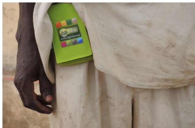
Many farmers have their own mobile... and many want to have their own copies of farmer-training videos.