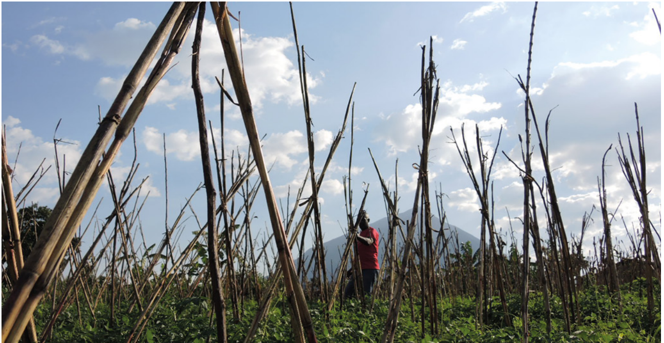
Farmers in southern Uganda keep maize stalks to stake their climbing beans.

Bangladeshi farmers making barriers to moisture (e.g. painting an earthen pot or coating it with used cooking oil or tar). With this information, viewers elsewhere can then create solutions using whatever materials they have available locally (e.g. using shea butter to seal the pot or keeping rice seed in a very dry room).