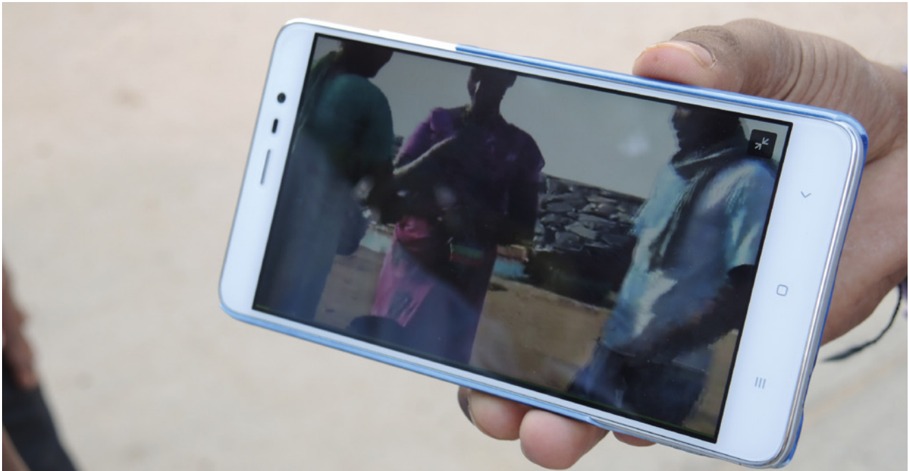
Increasingly, farmers across the South watch videos from the Access Agriculture video platform on their mobiles.