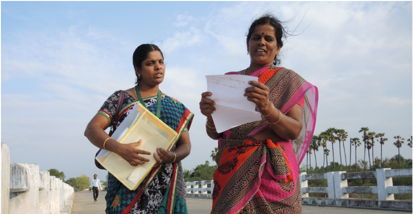
By letting farmers read a one-page fact sheet, you can quickly test if your ideas for a video make sense.

and adapt the storyboard with farmers in their local language. Videos are made by filming extension agents or farmers who explain a particular technique, following the storyboard. Digital Green then uses the same storyboard in different sites, with the dialogue changing according to the speakers and the location (Hailu, 2015; Digital Green website ).