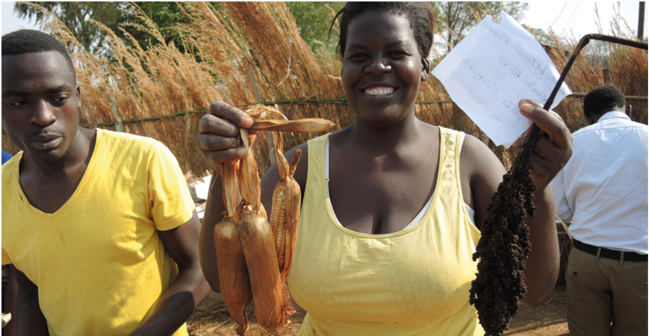
Quality training videos instill a sense of pride in farming and can inspire farmers to collaborate in new ways.