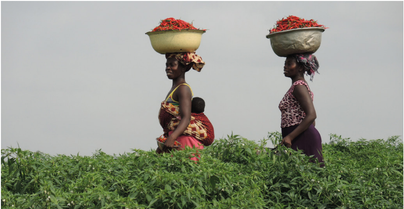
Quality farmer-training videos have encouraged tens of thousands of women in Uganda to engage in organic value chains.

After filming, a good video requires a lot of time investment to edit and to perfect the final details. For example, deciding precisely where to cut the images, then adding interview footage, voice-over and music, all require great effort before everything fits well together. In the process of editing, the video producer might even find that parts of the transcribed interviews can improve the script. This then means that some parts of the voice-over may need to be re-recorded. This process can try the patience of not only the video-makers – but also of all the other people who worked on the video, who do not understand why they must wait so long to view the final results. As video-maker Jane Nalunga says from experience, “ while the producer works hard to finish the video before the end of the year, farmers expect to see the finished video the week after filming ” (Nalunga, 2015).